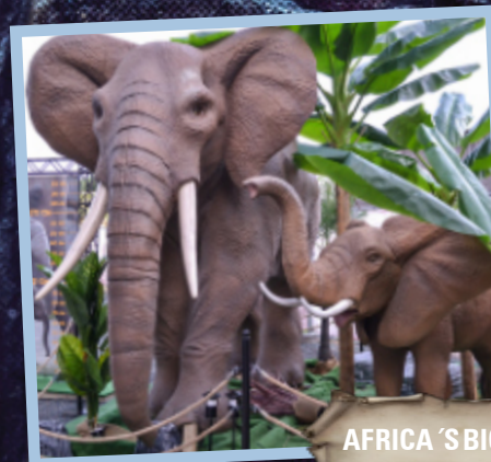
AFRICA'S BIG 5

Das Erlebnismanagement GmbH Schildbach 230, 8230 Hartberg Umgebung, Austria T. +43 3332 / 666 26-28 amazibition.com